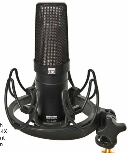
Shown with included S-44X Shock Mount Suspension