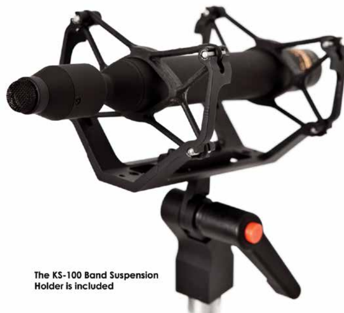
The KS-100 Band Suspension Holder is included